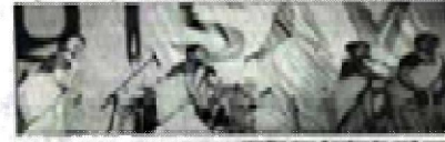
छात्र-छात्राओं ने सांस्कृतिक स्पर्धाओं में दिखाया जलवा।

खेल और सांस्कृतिक स्पर्धाओं में छात्र-छात्राओं ने दिखाया जलवा।